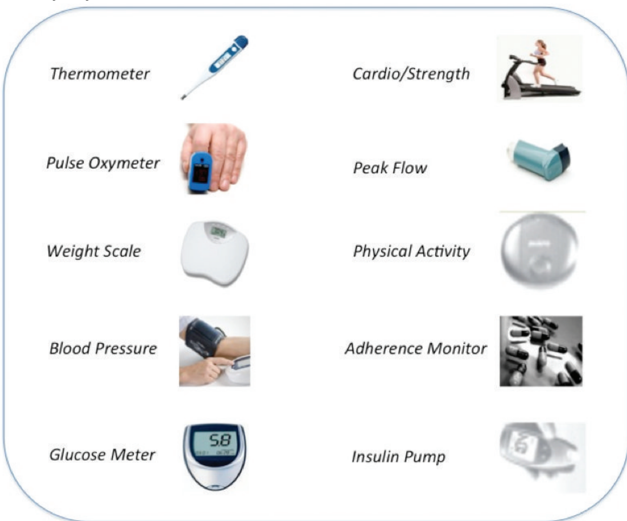
Figure 2. Examples of personal biomedical devices.

The degree of invasive surgery required to implant such devices depends on the type of user. While chronic patients or elder people are more likely to accept technology which promises an improvement in quality of life, healthy individuals might adverse it. This advocates the elderly to be targeted first.