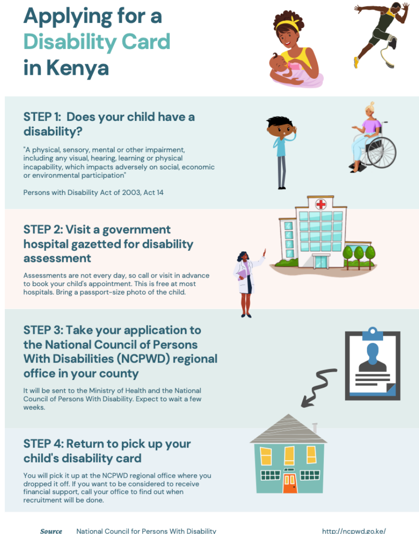
Figure 1. Representation of a downloadable step-by-step guide to obtaining a disability card in Kenya created for this study.