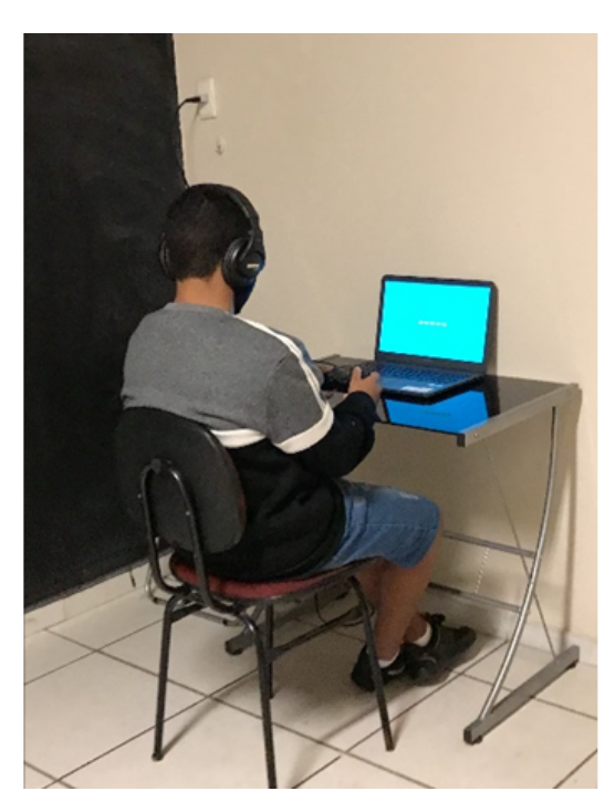
Figure 2. Experimental setup.

The first author (CGM) contacted parents or caregivers via telephone to arrange the experiment day. For the ADHD group, the experiment was scheduled on the same day as the participant's psychiatrist appointment at the university hospital, or another agreed-upon day, to enhance adherence to the intervention. Children were individually escorted to a quiet office while their parents completed behavior scales and a sociodemographic questionnaire in the waiting room. It is crucial to highlight that this was a clinical sample. All children were under psychiatric monitoring and had a confirmed diagnosis of ADHD prior to participation.